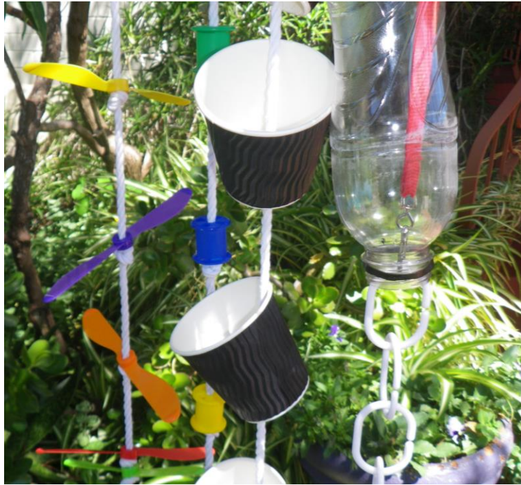
These are some ideas for "rain chains"

We shall be using our knowledge of Science, Technology, Engineering, English and Mathematics to create a model "rain chain", test its effectiveness and suggest improvements.