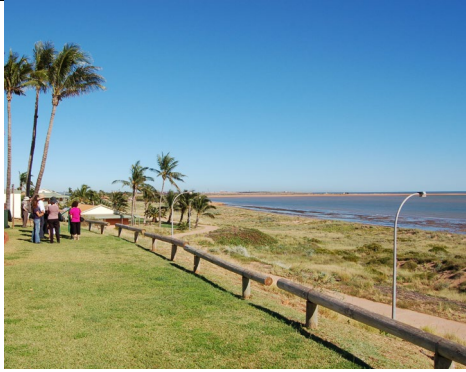
(M) Koombana Lookout, Port Headland