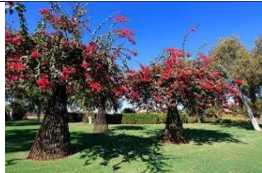
(M) Port Hedland Gardens