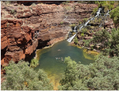
(N) Karijini National Park